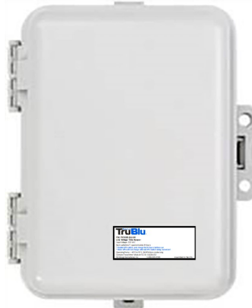
Dimensions (in): 9x6x3